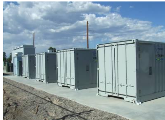
0.8 MW lead battery system