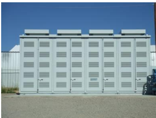
1 MW NAS battery system