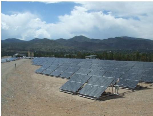
1 MW photovoltaic system