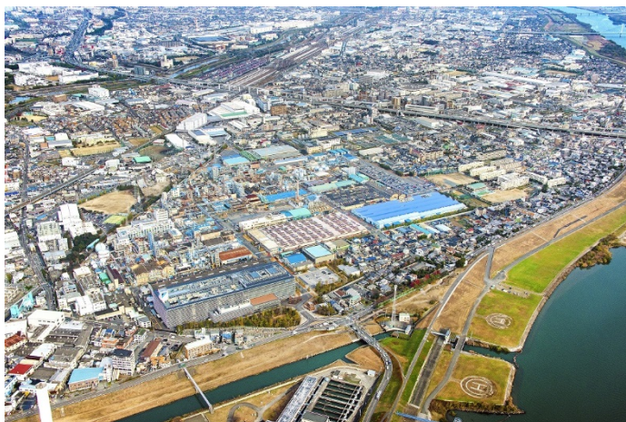
Daikin's Yodogawa Plant where the joint demonstration in the reaction process of chemicals will be conducted