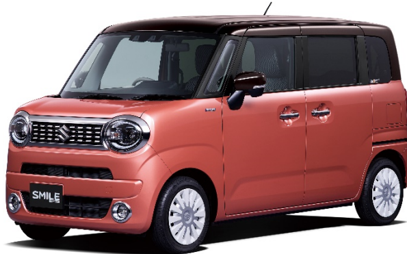
New Wagon R Smile equipped with our stereo camera

* 4 Vehicles certified by Ministry of Land, Infrastructure, Transport and Tourism, which fulfill particular performance levels of collision damage mitigation braking and sudden acceleration control device for pedal misapplication, as part of measures to prevent accidents.