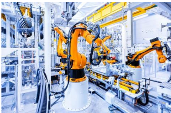
Robotic SI of Hitachi Automation

Aim to become a global leader by expanding its ability to comprehensively propose solutions, combining front engineering capabilities, intelligent robotic vision systems and digital solutions