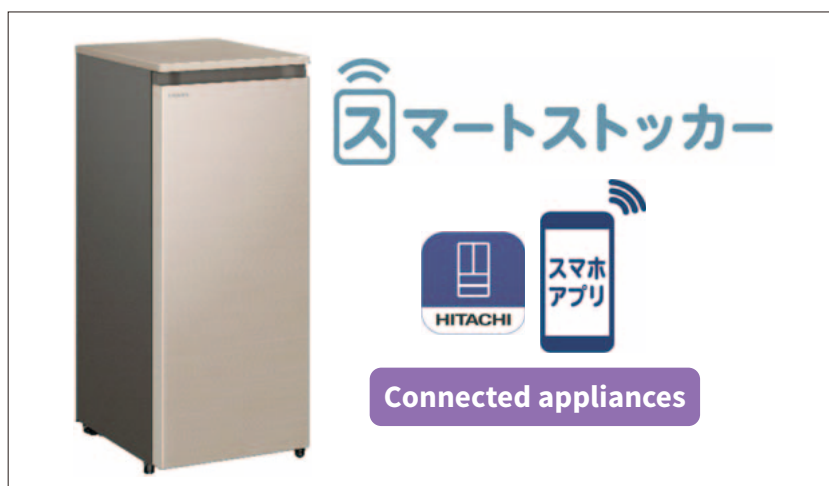
2 R-KC11R smart stocker

(1) Weight sensors are installed in the second and fifth shelves of the compartment to detect the weight and display the stock status on a smartphone. The app will