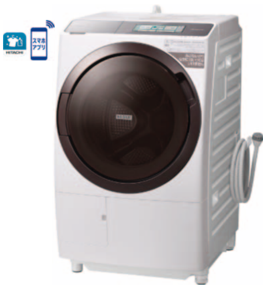
1 BD-STX110G (W) front-loading washer/dryer

Hitachi has released the BD-STX110G front-loading washer/dryer (11 kg washing capacity, 6 kg drying capacity), which features a control panel with wide color liquid crystal display (LCD) touch panel that provides easy viewing and operation.