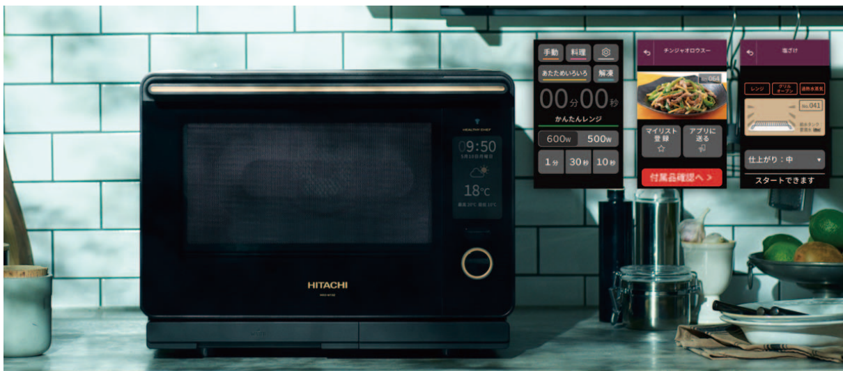
4 Gentle shape that blends smoothly into daily life like a tool

and a matte finish, and the handles have gold accents embedded in them to blend in gently with the kitchen. (Hitachi Global Life Solutions, Inc.)