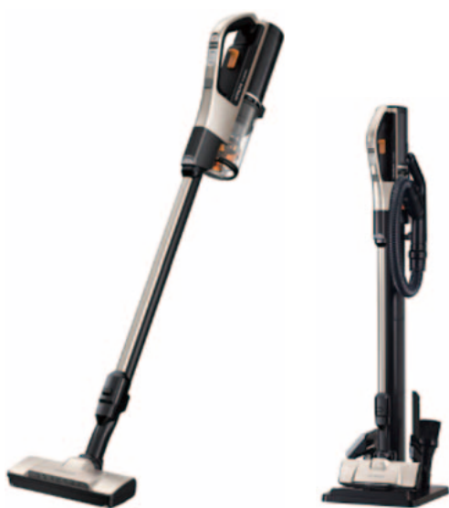
3 PV-BH900J (left), state when stored in the upright charging stand (right)

(1) A new jet three dimensional (3D) fan motor is used that increases the air volume by approximately 15%* 1 compared to the previous model* 2 . Also, by downsizing the fan motor body by approximately 46%* 3 and reducing the weight of the cleaner body and head, Hitachi has achieved a standard weight* 4 of 1.7 kg, approximately 0.2 kg lighter than previous models.