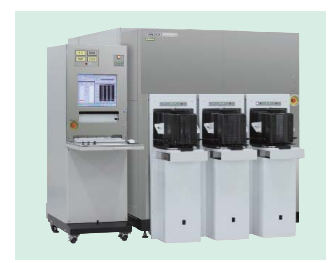
Fig. 2—CD-SEM for Use in Semiconductor Production. This is a photograph of the CG5000 high-resolution field emission beam critical dimension scanning electron microscope (FEB CD-SEM) (Hitachi High-Technologies Corporation). The CG5000 is used for the dimensional measurement of the patterns formed on semiconductor or other wafers.

Hitachi develops new technologies as it seeks to obtain "ultimate performance" from products. The critical dimension scanning electron microscope (CD-SEM) provides a typical example (see Fig. 2). Since