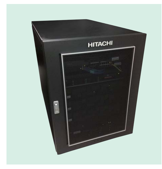
Fig. 3—Hitachi High-speed Data Access Platform<sup>*3</sup>. Centered around the ultrafast database engine, the platform contributes to the use of big data by enabling ultra-high-speed data searches.