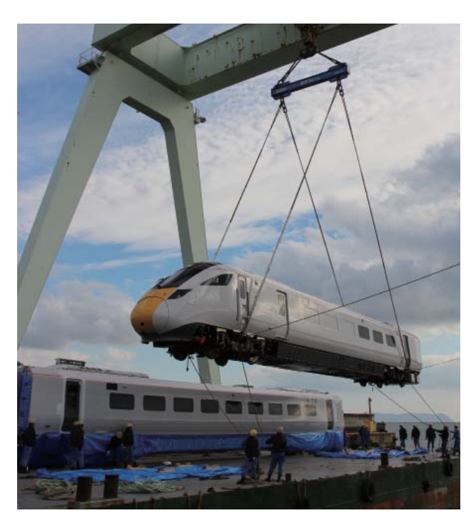
Fig. 4—Shipment of Class 800 Rolling Stock for the UK. Department for Transport Intercity Express Programme (IEP). Hitachi successfully complied with European standards by taking analysis techniques and material technologies built up through product development in a variety of fields and applying them to rolling stock safety design.

detected. Along with faster speeds there is also a need for comfort. Hitachi has developed the world's fastest elevator<sup>*2</sup> with a speed of 1,200 m/min by combining the above technologies for high-speed operation with active damping techniques that can detect tiny distortions in guide rails or lateral vibration caused by wind and reduce the associated vibrations, and techniques for controlling the air pressure in elevators cars to minimize ear blockages.